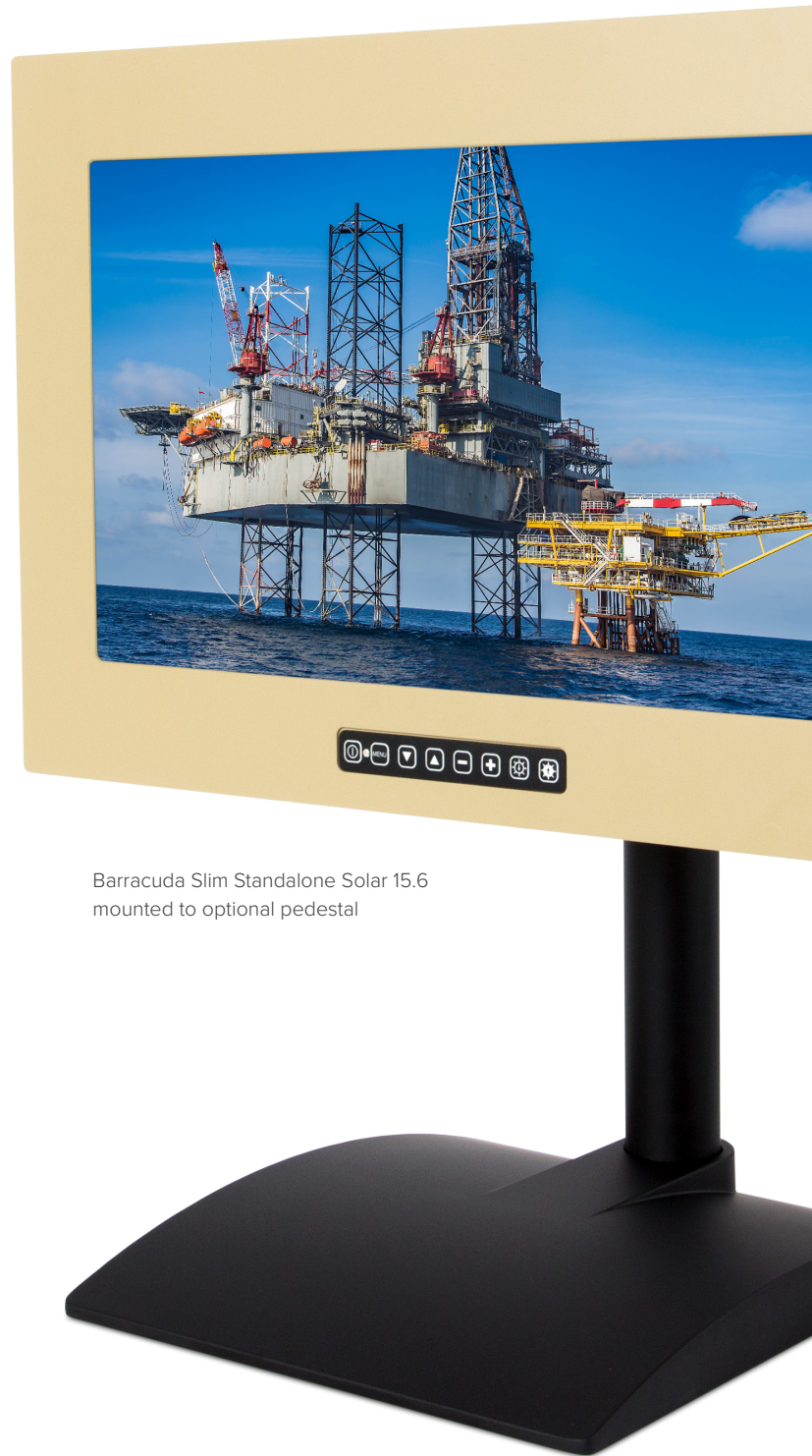
Barracuda Slim Standalone Solar 15.6 mounted to optional pedestal